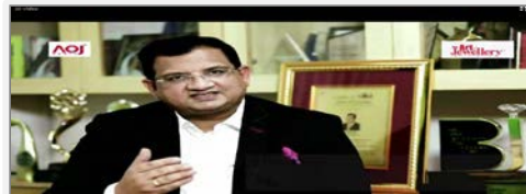
Auspicious Aksh. .