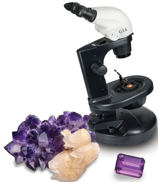
GIA microscope; rough and polished amethyst

Note: Support for Windows 8.1 and earlier, as well as MacOS 11 and earlier, is no longer available. Requirements subject to change; students will be given advanced notice of changes.