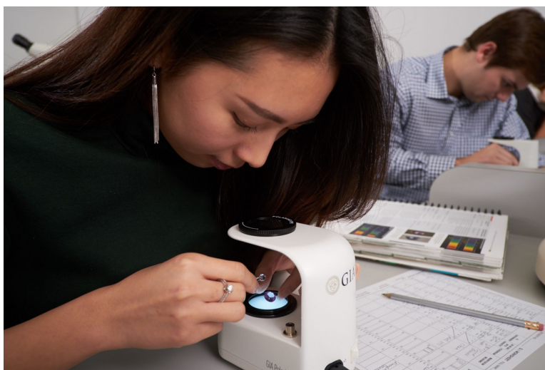
Students use gemological equipment to identify coloured stones