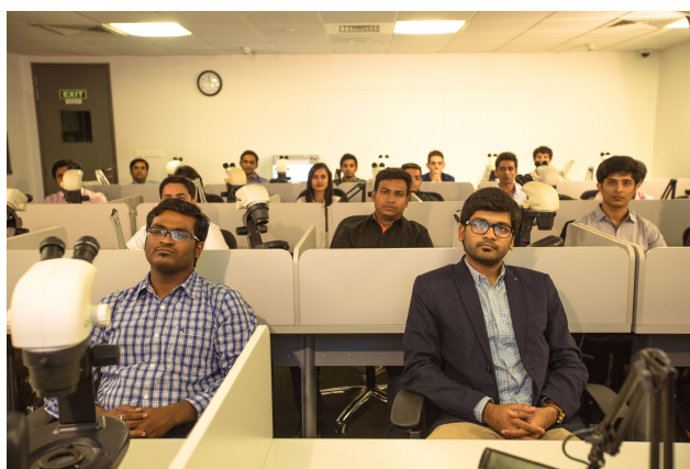
Top: Library; Bottom: Student Lounge; Bottom: Gemmology Classroom