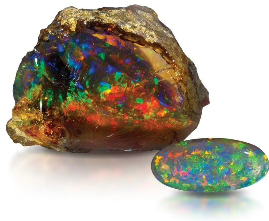
Rough and polished opal.

Note: Support for Windows 8.1 and earlier, as well as MacOS 11 and earlier, is no longer available. Requirements subject to change; students will be given advanced notice of changes.