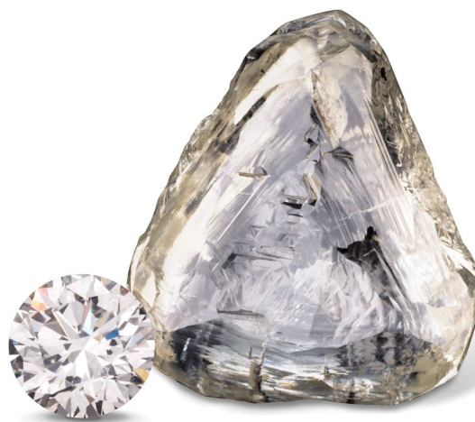
Rough and Polished diamonds

Note: Support for Windows 8.1 and earlier, as well as MacOS 11 and earlier, is no longer available. Requirements subject to change; students will be given advanced notice of changes.