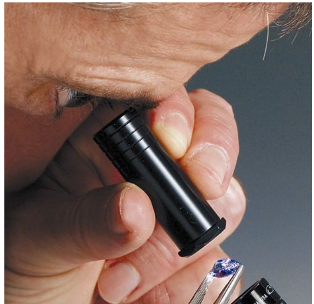
Gem Identification Lab students learn the proper use of gemological equipment like a polariscope (top) and dichroscope (bottom)