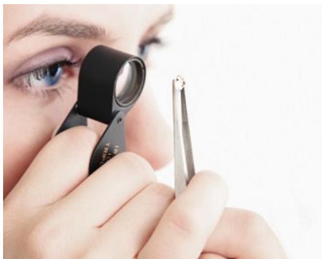
Diamond Grading Lab students assess a diamond's clarity using a 10X jeweller's loupe