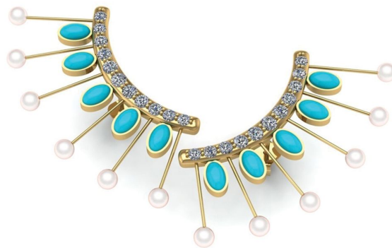
CAD-rendered earrings