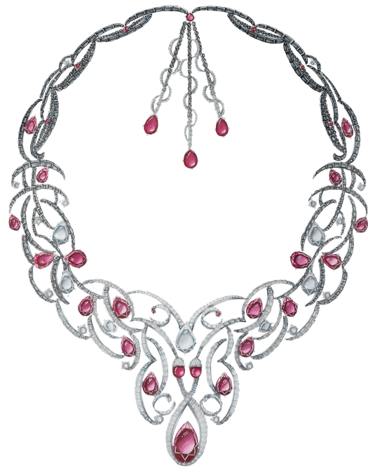
Hand-rendered necklace

Note: Support for Windows 8.1 and earlier, as well as MacOS 11 and earlier, is no longer available. Requirements subject to change; students will be given advanced notice of changes.