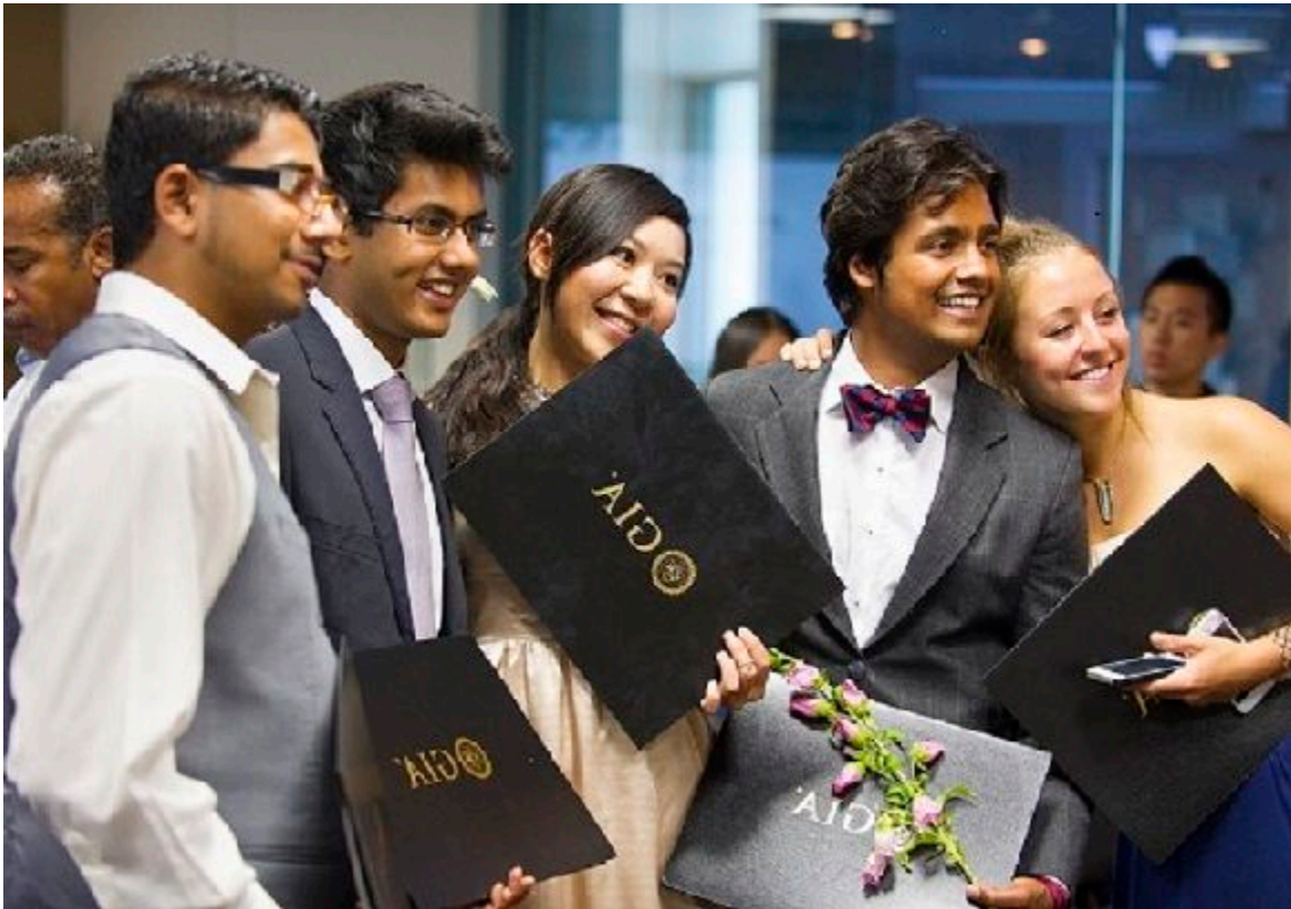
GIA On Campus Program Graduates

*Each practical exam allows for multiple attempts, see course syllabi for details.