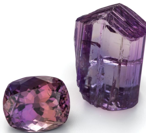
Tanzanite crystal and polished gem.

Note: Support for Windows 8.1 and earlier, as well as MacOS 11 and earlier, is no longer available. Requirements subject to change; students will be given advanced notice of changes.